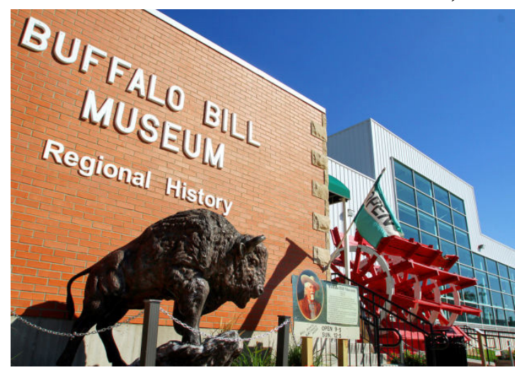
The Lone Star Stern Wheeler exhibit is the best example of a wooden boat built in the traditional Western Rivers fashion.

While today's visitors can't ride along with these heroic pioneers, they can climb aboard a majestic vessel from their time: the Lone Star Stern Wheeler. Designated as a National Historic Landmark, the Lone Star is the only surviving wooden-hulled vessel of its kind. According to Schiffke, it brings visitors back to 1890.