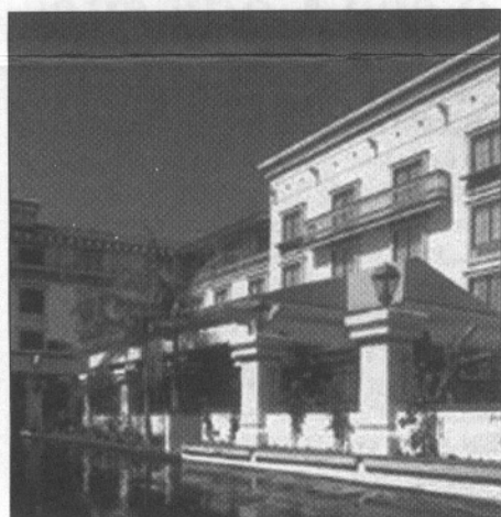
REUNION HEADQUARTERS HOTELS Courtyard by Marriott (star on map at right) "Reception and Information Hotel"

Old Town San Diego 2435 Jefferson St. San Diego, CA 9210 Tel. (619) 260-8500 or 1 (800) 255-3544 Fax. (619) 298-2427 Web. http://marriott.com/property/propertyPage/SANOT