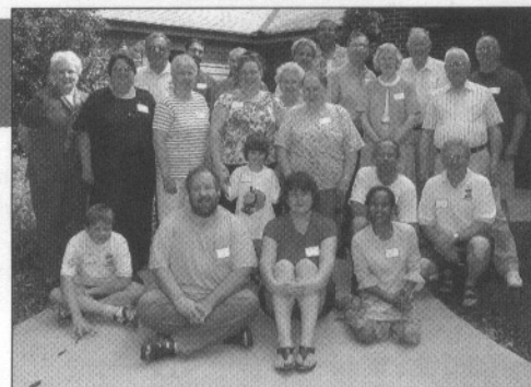
Cody Ohio Circle. Family crest shirts were also available for sale.