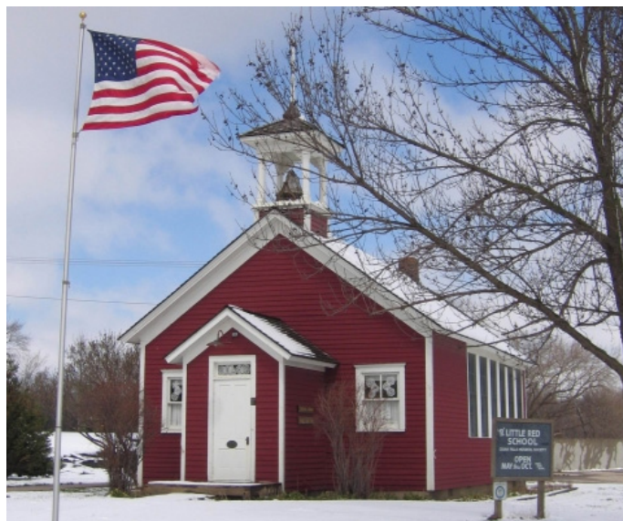
The "Little Red Schoolhouse" at Cedar Falls, Iowa

Classes were composed of children ranging in age from kindergarten to 8th grade, with one teacher to educate and manage them all. Older children helped teach the younger children, key to making the classroom run smoothly.