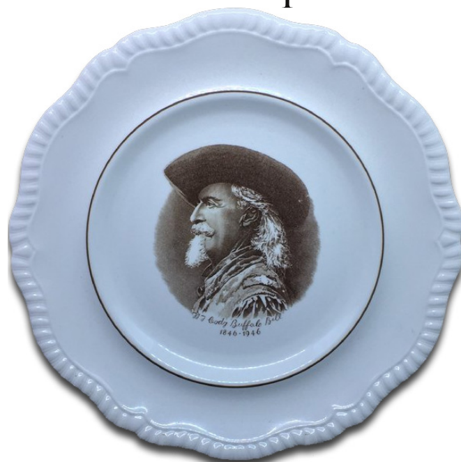
W.F. Cody Birth Centennial Plate, from the Collection

Let's have a round of applause for the team and their imagination and diligence in creating this wonderful experience for us all!