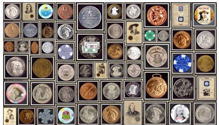
Metal, Plastic & Wood Coins, Rounds & Tokens