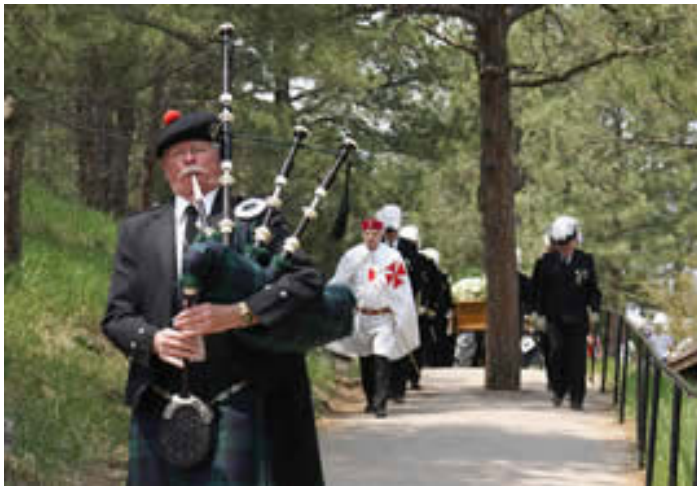
A piper leads the Lodge Brothers to Buffalo Bill's grave.

When Buffalo Bill was buried on this day, June 3, 1917, an estimated 20,000 spectators ascended the winding trail of Lookout Mountain to see the famous frontiersman laid to rest in what is touted as the largest burial in Colorado history.