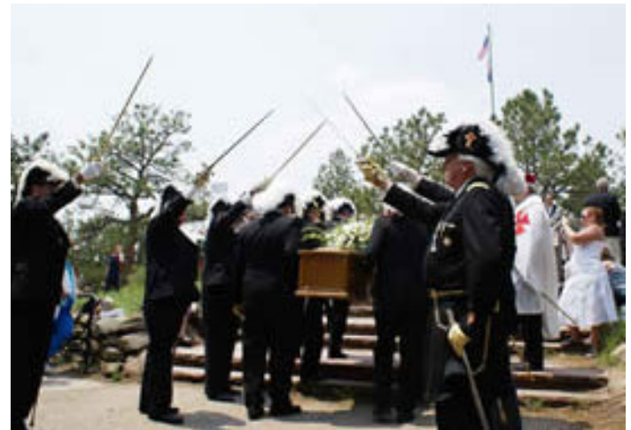
Here, the AF & AM salute Buffalo Bill in fine style.

Now, 100 years later, the Buffalo Bill Memorial Museum will host members of the Grand Lodge No. 1 of Golden Colorado , as