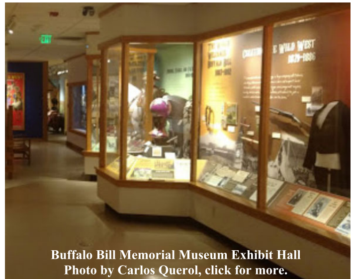
Buffalo Bill Memorial Museum Exhibit Hall, click for more.