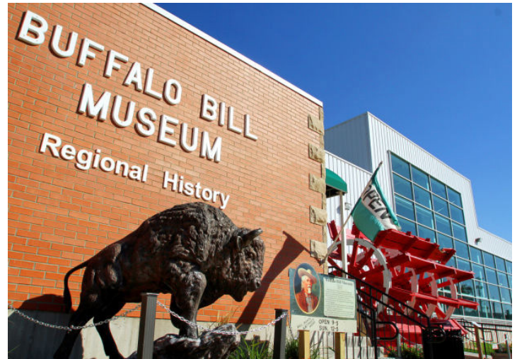
The Lone Star Stern Wheeler exhibit is the best example of a wooden boat built in the traditional Western Rivers fashion.