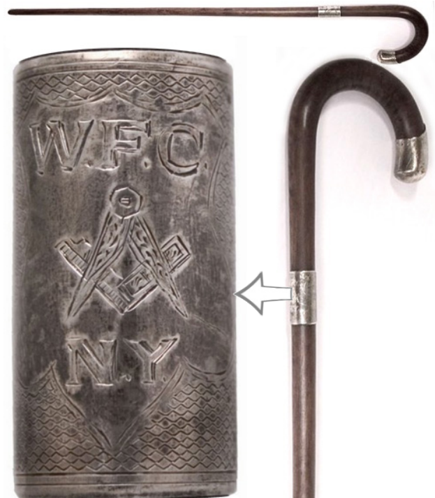
The Buffalo Bill Masonic Cane