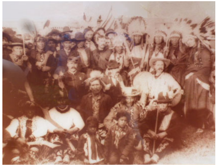
Buffalo Bill’s “Peace Jubilee” September 11, 1896 Where the Sioux and Chippewa made peace.

In the 1840s, the Chippewa living along Lake Superior’s south shore were collectively referred to as the La Pointe Band, but actually, small bands were scattered all along the shoreline. The Lakota Sioux Chief, Old Crow, hoped to defeat the Chippewa by raiding these small bands while avoiding tribe’s main camp at La Pointe. But, Chippewa Chief Buffalo received warning just in time to organize his own people to defend themselves!