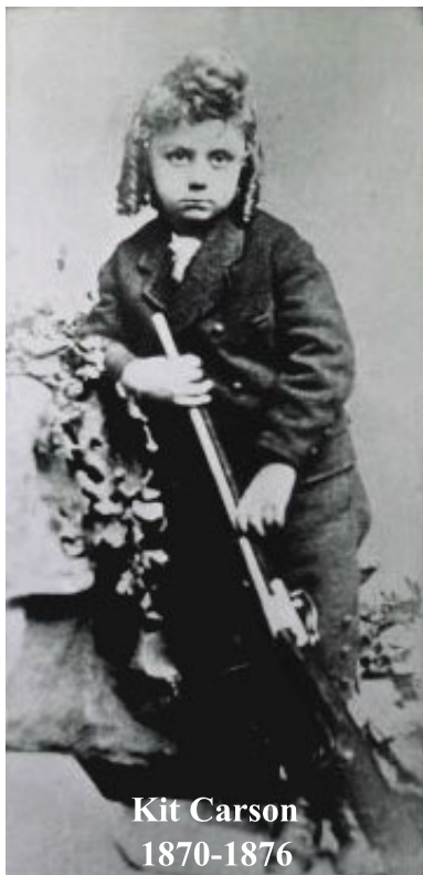
Kit Carson 1870-1876