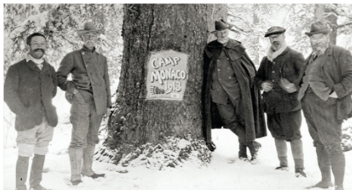
Camp Monaco in 1913 with Prince Albert's great, great grandfather, Buffalo Bill, Czar Nicholas and others. The magnificent tree in this photo was felled through age. The replacement tree was planted at Buffalo Bill Center of the West in honor of Prince Albert and Camp Monaco.

In 2009, Dr. Medicine Crow was awarded the Medal of Freedom. In 2010, a national conference of tribal leaders was to meet in Washington, D.C. When it was noted that Dr. Medicine Crow was not on the attendance list, it was requested that he be there. Again, Dr. Medicine Crow was following in the footsteps of his grandfather.