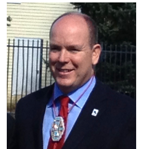
Prince Albert of Monaco in front of Buffalo Bill's childhood home in Cody.

See more about Prince Albert's visit next page!