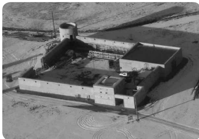
The fort as seen from the air during construction.