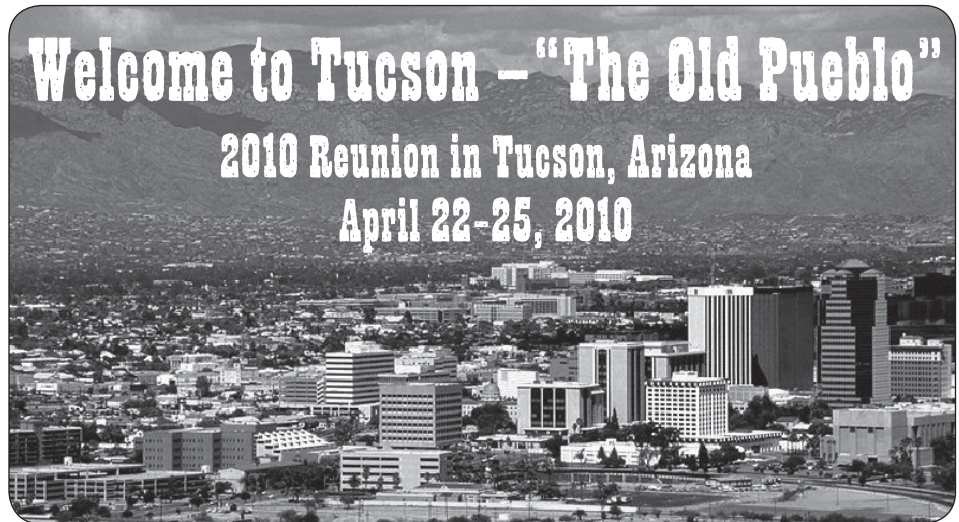
Tucson with Catalina Mountains in background

The reception and registration will be held at the Lodge on the Desert. Light