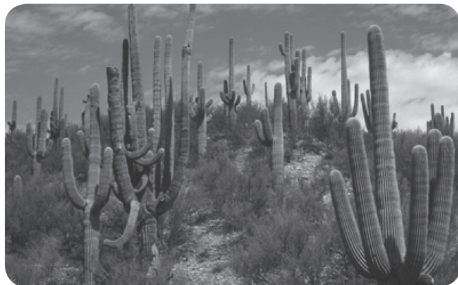
Saguaro

nonprofit organization dedicated to the conservation of the Sonoran Desert. Current operations and future growth are funded entirely by admissions, memberships, contributions and grants. It is accredited by the Association of Zoos and Aquariums and is a member of the American Association of Museums .