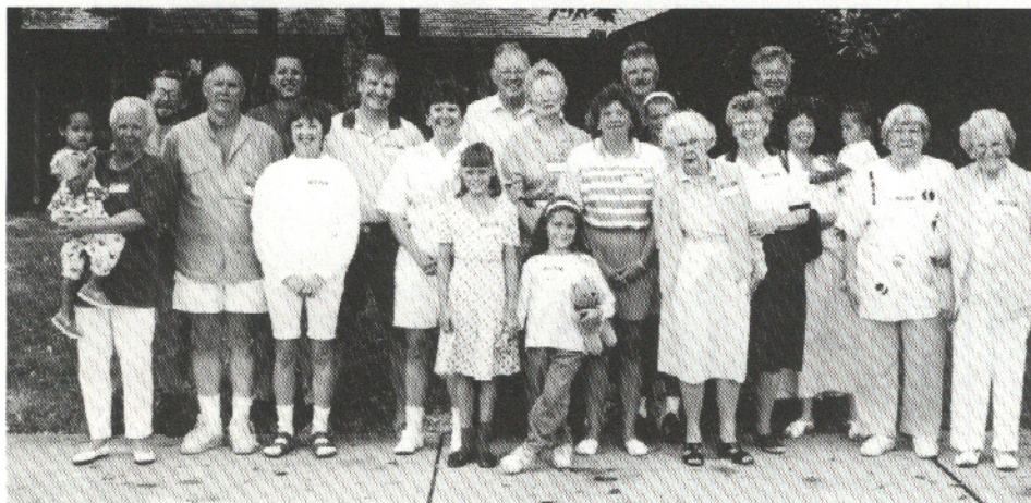
The Ohio Circle met in August in Columbus.