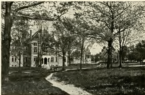
SCIENCE HALL AND MUSEUM, OLIVET COLLEGE

Fall Term Begins September 20. Strong courses in Pedagogy. Salaries of graduates last year, teaching without experience, averaged $630 for women, $850 for men. Great demand for Olivet graduates in business and teaching. Faculty of experts.