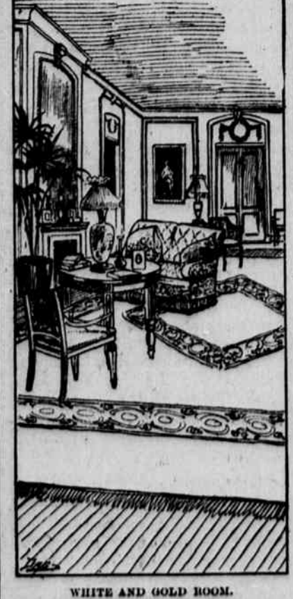
illustration of a room of this sort. The color scheme is white and gold. An empire design decorates the walls

The electric light fixtures are in the shape of gilt candles with yellow silk shades. There is a high gilt mirror over the mantel. The furniture is mahogany. The table, which supports a lamp with a yellow shade, is hand-somely inlaid. Yellow upholstery prevails, while paims and a few cheerful oil paintings add to the brightness of the room. R. DE LA BAUME.